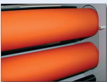
Heated Silicon Rollers