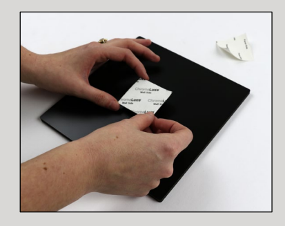
To adhere mount to panel, remove Panel Side liner and place in center of tile.