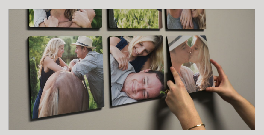
To display, remove Wall Side liner and place on wall.