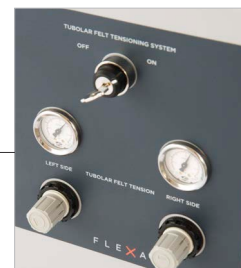
Pneumatic felt belt tension setting, independent left and right