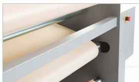
High quality felt belt with automatic tracking

Automatic pre-heating timer (to set the required time)