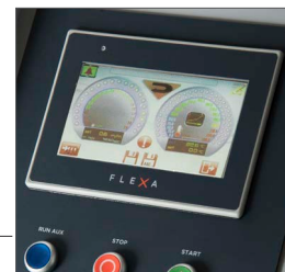
Digital colour touch-screen display with easy-to-use and intuitive control panel

Cooling system with automatic shutdown by reaching the safety temperature