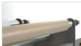
6 shafts for materials: 3 motorized rewinding shafts with clutch and 3 unwinding shafts with brake

Storage up to 24 different settings (working temperature, speed, production remarks)