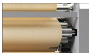
Exclusive oil filled drum that allows you to work even with damaged resistances

Rapid replacement of the heating elements without oil drain