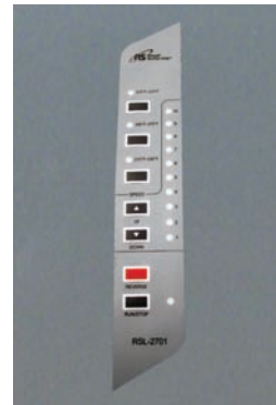
User friendly controls simplify operation