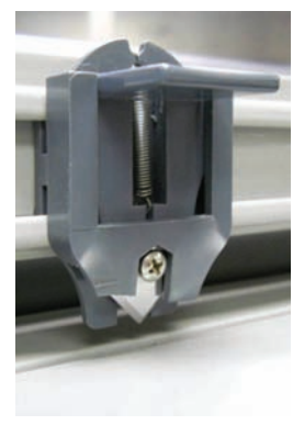
Cross cutter permits simple cutoff as the laminated material exits the rear