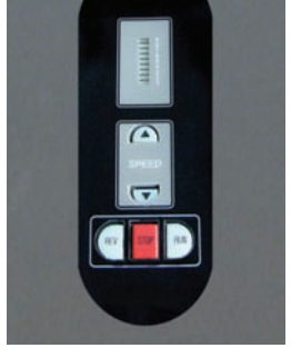
Auto grips to secure User friendly controls film cores to feed and simplify operation wind up rollers