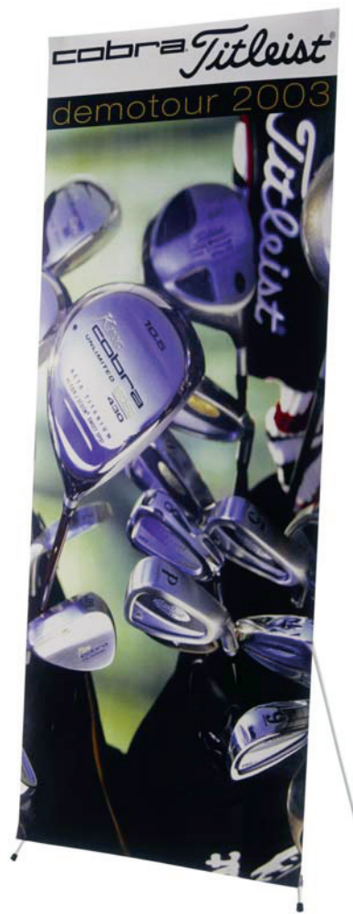
32" Wide x 71" High