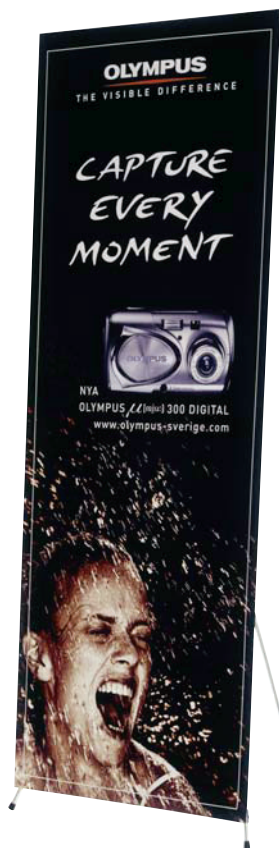
24" Wide x 63" High