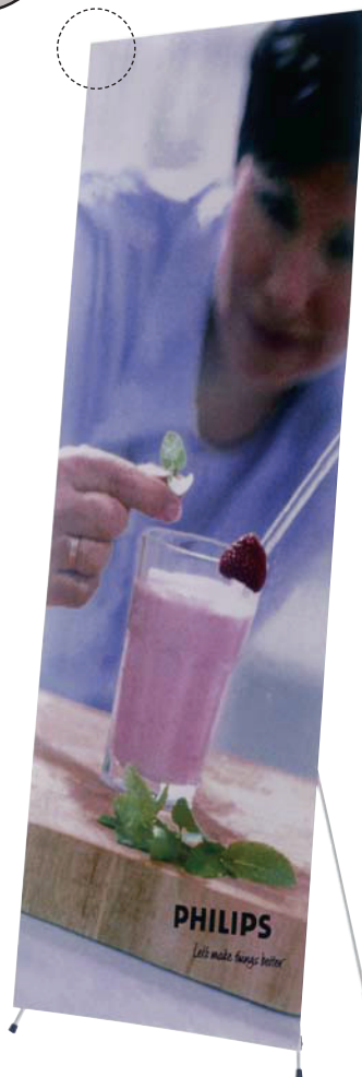
26" Wide x 71" High