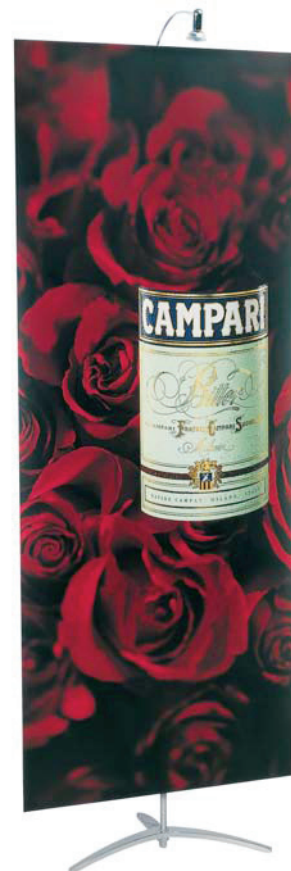
Size of the graphic in the image above 31 1/2" Wide x 82" High