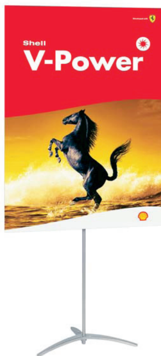
Size of the graphic in the image above 27 9/16" Wide x 36" High