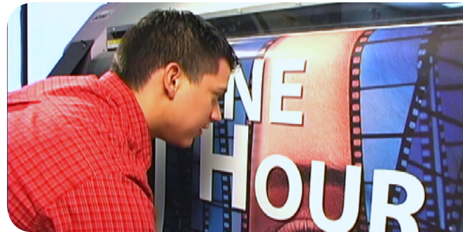
Print to 1 Aqueous Ink Jet or Entry Level Solvent printer.