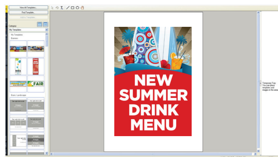
PosterArtist poster creation software