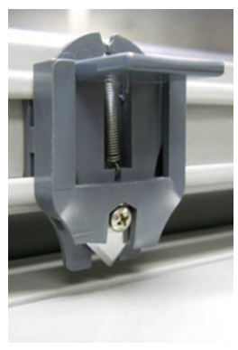
cutter permits simple cutoff as the laminated material exits the rear