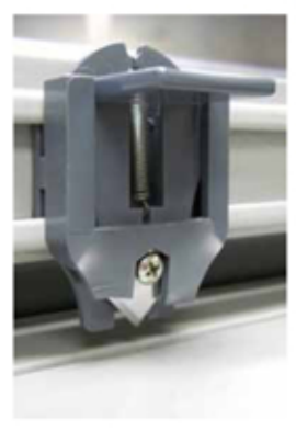
cutter permits simple cutoff as the laminated material exits the rear