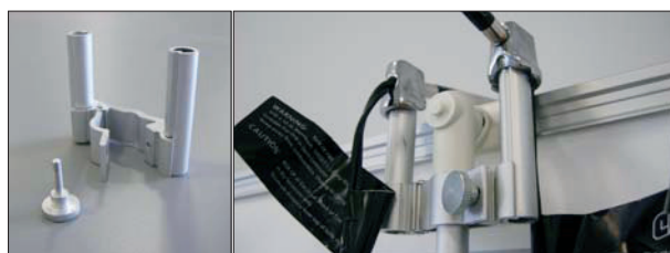
Use the double-sided adapter (supplied with the L5-BLA-50US) for the Expand MediaScreen 2 and Expand SmartStand (double-sided).