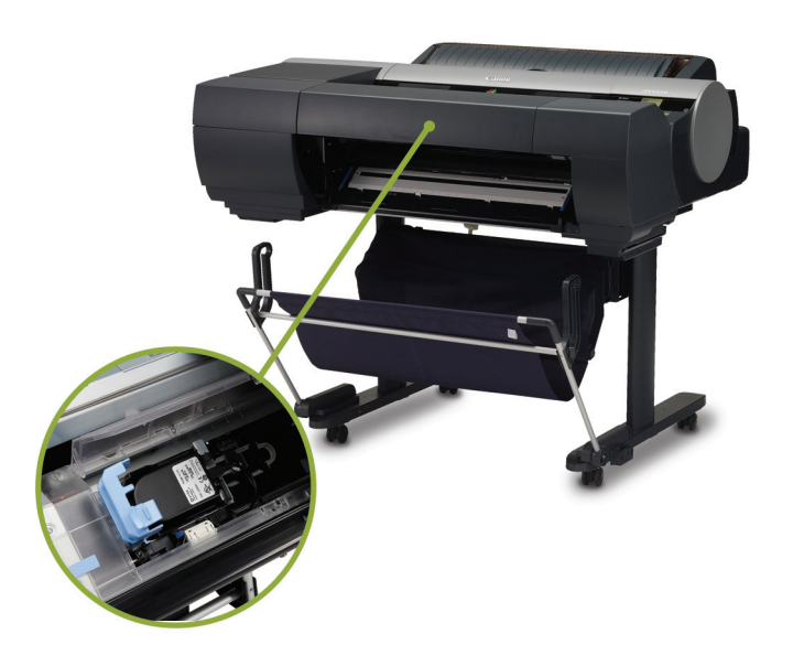
iPF6450 Printer with Optional SU-21 Spectrophotometer

Color Consistency is a device's ability to produce and reproduce colors without a shift or change in tone, hue, or density. An image printed on a device that's producing colors consistently will always look the same any time that image is printed on that device on the same media in the same mode. Canon includes the multi-sensor to help ensure color accuracy and consistency for a single printer when more than one is being used in a printing environment.